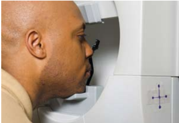
Visual field testing is used to monitor peripheral, or side, vision.

Photography of the optic nerve or other computerized imaging may be recommended. Some of these tests may not be necessary for everyone. These tests may need to be repeated on a regular basis to monitor any changes in your condition.