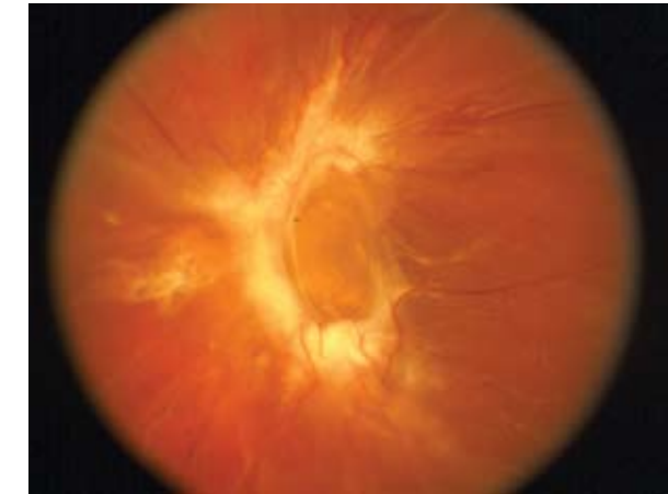
Traction retinal detachment

Vitreous hemorrhage alone does not cause permanent vision loss. When the blood clears, vision may return to its former level unless the macula is damaged.