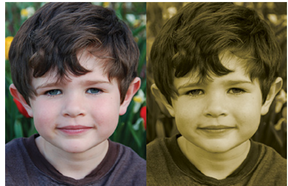
Left, normal vision. At right, dulled or yellowed vision.