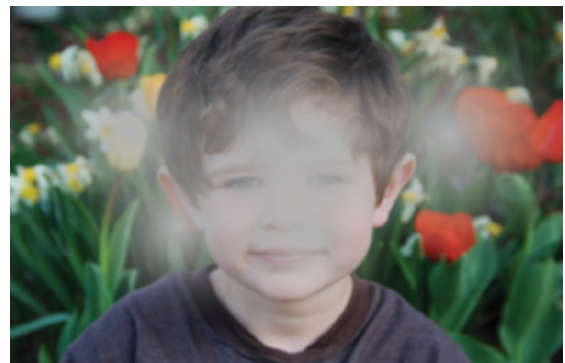
Blurring or dimming of vision